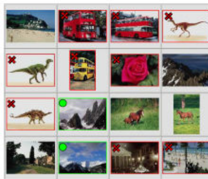
Figure 1: An example of an RF display, using the RVPIR retrieval

Proposed methods for Texture Unit and Texture Spectrum The classification, and recognition of textures becomes complex by the above method due to large number of TU that ranges from 0 to 6561. The proposed scheme reduces the above complexity by reducing overall TU from 0 to 255. For this the proposed paper outlines two methods. The method 1 is named as Reduced Texture Spectrum (RTS) and the method 2 is named as Reduced Texture spectrum with Lag value (RTL) and they are explained below. In RTS, the texture unit is defined by the following equation